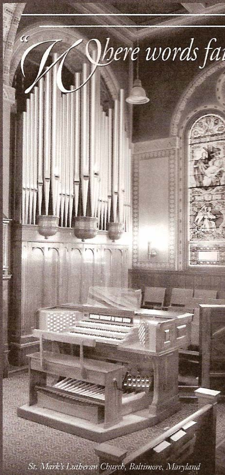
St. Mark's Lutheran Church, Baltimore, Maryland